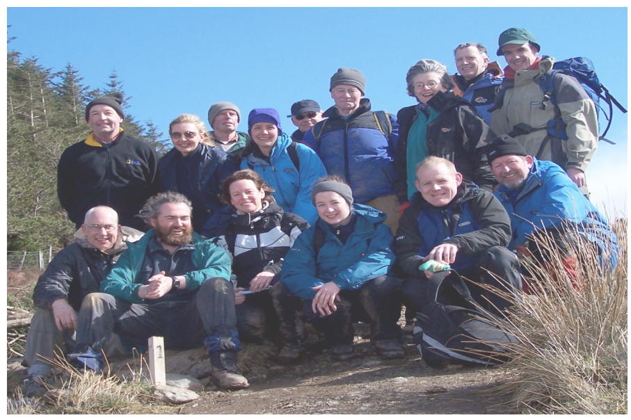
Some of the Mountain Meitheal volunteers amongst the many who repaired, landscaped and re-seeded the repair site along part of the Wicklow Way

Our repairs and improvements to the Glensoulan/Deerpark section of the Wicklow Way are almost complete. Fifty nine Meitheal volunteers gave over 700 hours of their valuable time to this important project. They constructed over 800 metres of new trail with steps, water bars and landscaping which also involved sowing grass seed specially chosen by the ecologists at WMNP over 2.47 acres of the site. This work was part of a three way